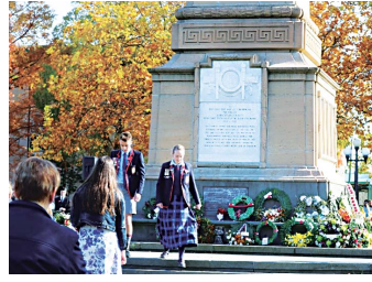
(Pictured above): Returning to the group after laying the wreath.